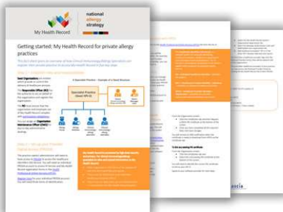
Fact sheets and guides for getting started

All available on the NAS project website